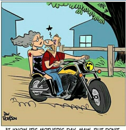
"I KNOW IT'S MOTHER'S DAY, MAW, BUT DON'T FLIP THE BIRD TO BIKERS THAT ARE BIGGER THAN ME AGAIN."