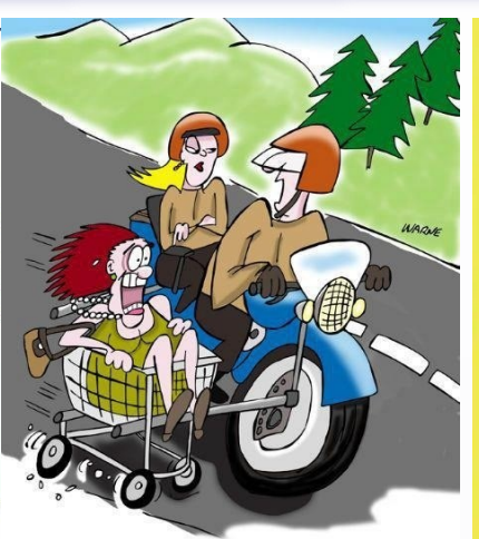
"First of all, you're the one that wanted me to include your more and secondly, you gotta admire my ingenuity.